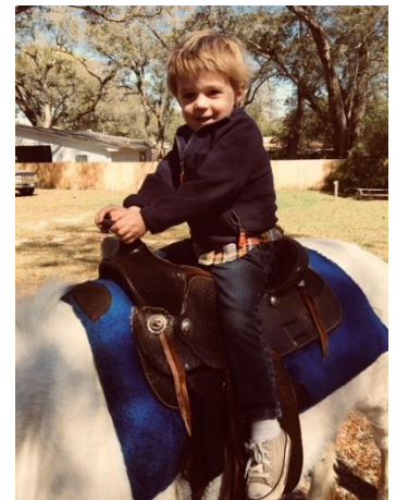
Western Day Fun!